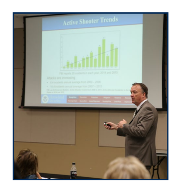
Homeland Security Representative presents to area Facility, Security, and Law Enforcement professionals