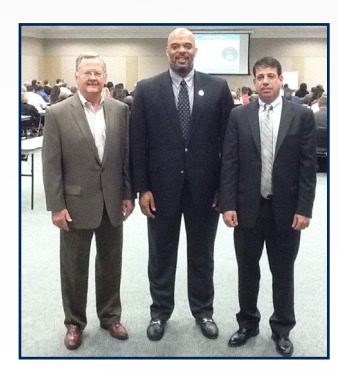
Superintendent Colbert with presenters from the Department of Homeland Security