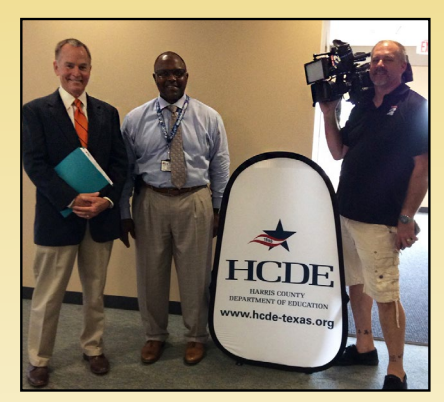
HCDE serves as a resource to local media during the Active Shooter training as they discuss tactics employed during the Ohio State attack earlier that day