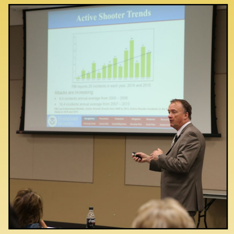
Homeland Security Representative presents to area Facility, Security, and Law Enforcement professionals

As part of its ongoing efforts to ensure the safety of area schools, HCDE's Center for Safe and Secure Schools partnered with the U.S. Department of Homeland Security (DHS) to help local leaders better prepare for active shooter incidents.